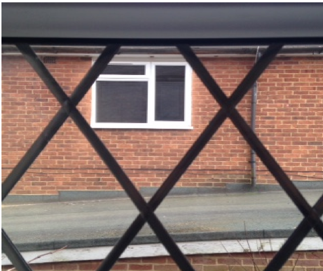
View towards no. 27 from no.25's first floor bathroom